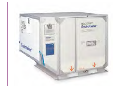
ENVIROTAINER (RKN) Refrigerated container -20°C/+20°C