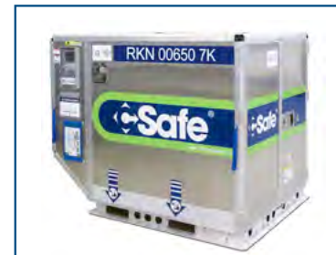
C-SAFE (RKN) Refrigerated container +4°C/+25°C