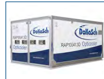
DOKASCH (RAP) Refrigerated container +2°C/+30°C