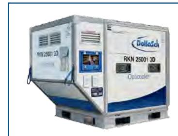
DOKASCH (RKN) Refrigerated container +2°C/+30°C