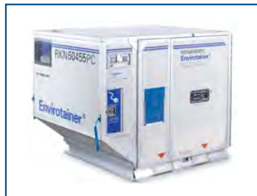
ENVIROTAINER E1 (RKN) Refrigerated container 0°C/+20°C