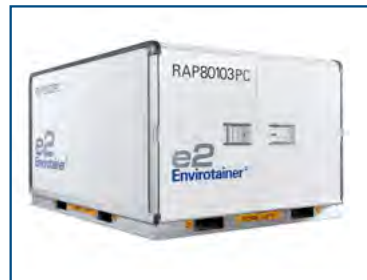
ENVIROTAINER E2 (RAP) Refrigerated container 0°C/+25°C