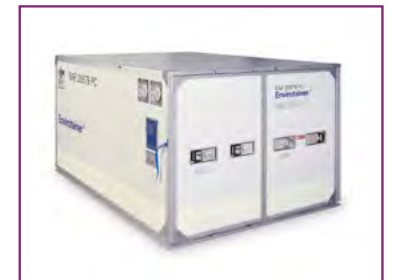
ENVIROTAINER (RAP) Refrigerated container -20°C/+20°C