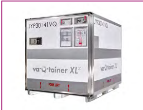
VA-Q-TAINER XLx Passive container -70°C/+25°C