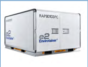
ENVIROTAINER E2 (RAP) Refrigerated container 0°C/+25°C