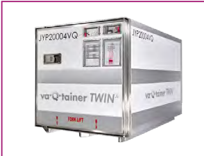
VA-Q-TAINER TWINx Passive container -70°C/+25°C