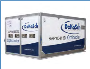
DOKASCH (RAP) Refrigerated container +2°C/+30C