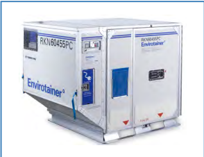
ENVIROTAINER E1 (RKN) Refrigerated container 0°C/+20°C