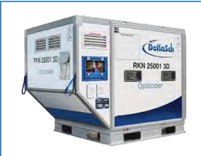
DOKASCH (RKN) Refrigerated container +2°C/+30C