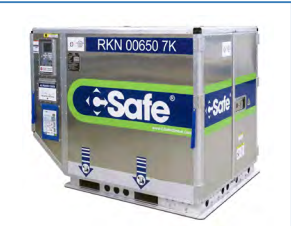
C-SAFE (RKN) Refrigerated container +4°C/+25°C