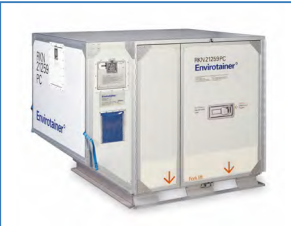
ENVIROTAINER (RKN) Refrigerated container -20°C/+20°C