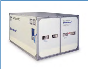
ENVIROTAINER (RAP) Refrigerated container -20°C/+20°C