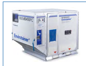
ENVIROTAINER E1 (RKN) Refrigerated container 0°C/+20°C