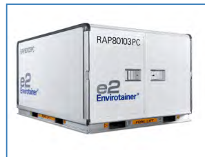
ENVIROTAINER E2 (RAP) Refrigerated container 0°C/+25°C