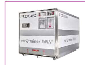
VA-Q-TAINER TWINx Passive container -70°C/+25°C

The best solution for your healthcare cargo: abc PHARMA