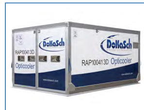
DOKASCH (RAP) Refrigerated container +2°C/+30°C