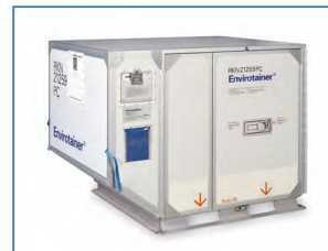
ENVIROTAINER (RKN) Refrigerated container -20°C/+20°C