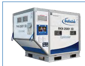
DOKASCH (RKN) Refrigerated container +2°C/+30°C