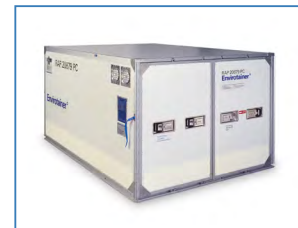
ENVIROTAINER (RAP) Refrigerated container -20°C/+20°C