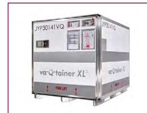
VA-Q-TAINER XLx Passive container -70°C/+25°C