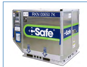
C-SAFE (RKN) Refrigerated container +4°C/+25°C