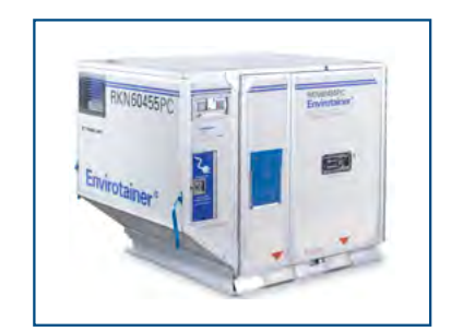
ENVIROTAINER E1 (RKN) Refrigerated container