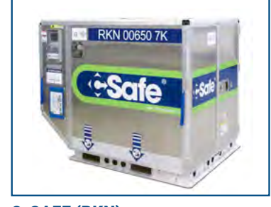
C-SAFE (RKN) Refrigerated container +4°C/+25°C