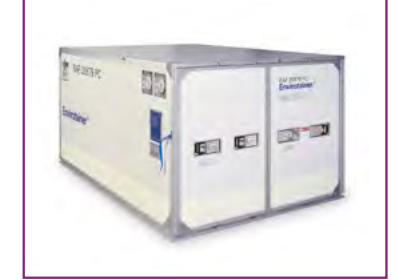
ENVIROTAINER (RAP) Refrigerated container -20°C/+20°C