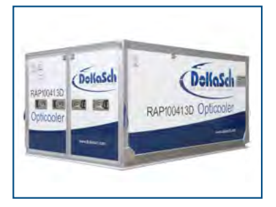
DOKASCH (RAP) Refrigerated container +2°C/+30C