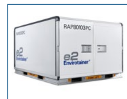
ENVIROTAINER E2 (RAP) Refrigerated container 0°C/+25°C