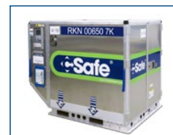
C-SAFE (RKN) Refrigerated container +4°C/+25°C