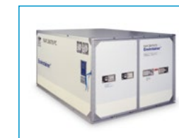
ENVIROTAINER (RAP) Refrigerated container -20°C/+20°C