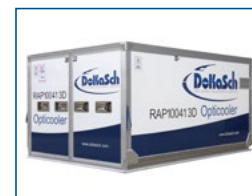
DOKASCH (RAP) Refrigerated container +2°C/+30°C