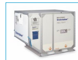
ENVIROTAINER (RKN) Refrigerated container -20°C/+20°C