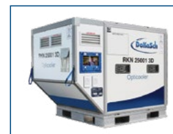
DOKASCH (RKN) Refrigerated container +2°C/+30°C