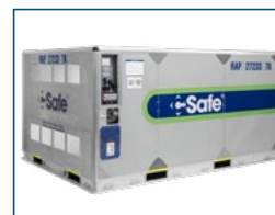
C-SAFE (RAP) Refrigerated container -30°C/+54°C