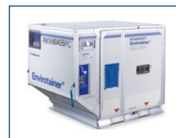
ENVIROTAINER E1 (RKN) Refrigerated container 0°C/+20°C