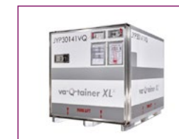
VA-Q-TAINER XLx Passive container -70°C/+25°C