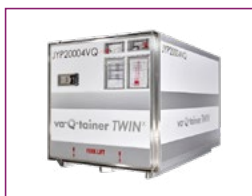
VA-Q-TAINER TWINx Passive container -70°C/+25°C